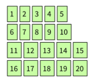
Figure 2. Example visualization, initial state

pages 135-144, New York, NY, USA, 2006. ACM Press. . URL http://scg.unibe.ch/archive/papers/Meye06aMondrian.pdf.