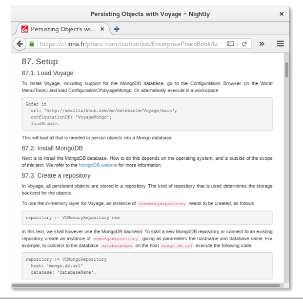
Figure 3. Example of HTML Generated with Pillar

Contrary to LAT_EX where extensions can be written in the same language as the document, extending Pillar requires writing Pharo code. We wanted to make Pillar extensible to handle several use cases ( e.g. ,, book writing and slide-based teaching) without overwhelming the users with complex syntax.